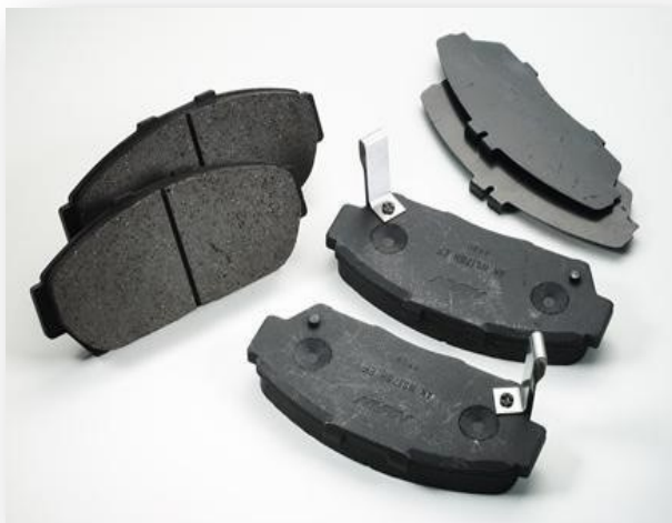
EXAMPLE – DISC BRAKE SET

In the automotive aftermarket, a Set may be a similar group of parts, such as a Brake Caliper Set, Air Filter Set, or Differential Gear Set; or it could be a collection of materials or tools which are similar, such as a Tool Set, or a Sandpaper Assortment.