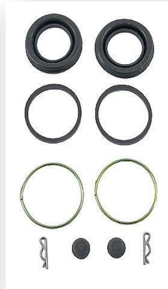
DISC BRAKE CALIPER KIT

A “Set” is defined as a group or collection of things that belong together or resemble one another.