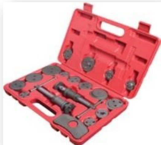
DISC BRAKE SET CALIPER TOOLSET