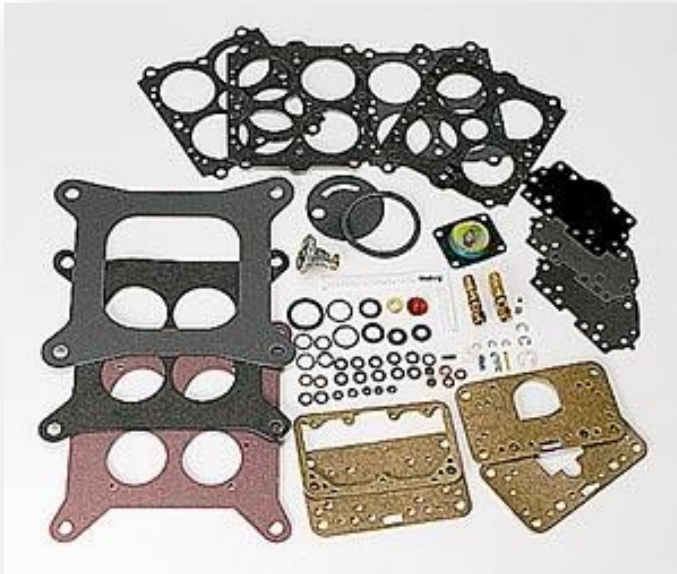
EXAMPLE – CARBURETOR REBUILD KIT