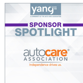
Sponsor Spotlight post on YANG's LinkedIn