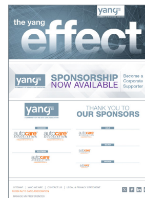
YANG Effect newsletter